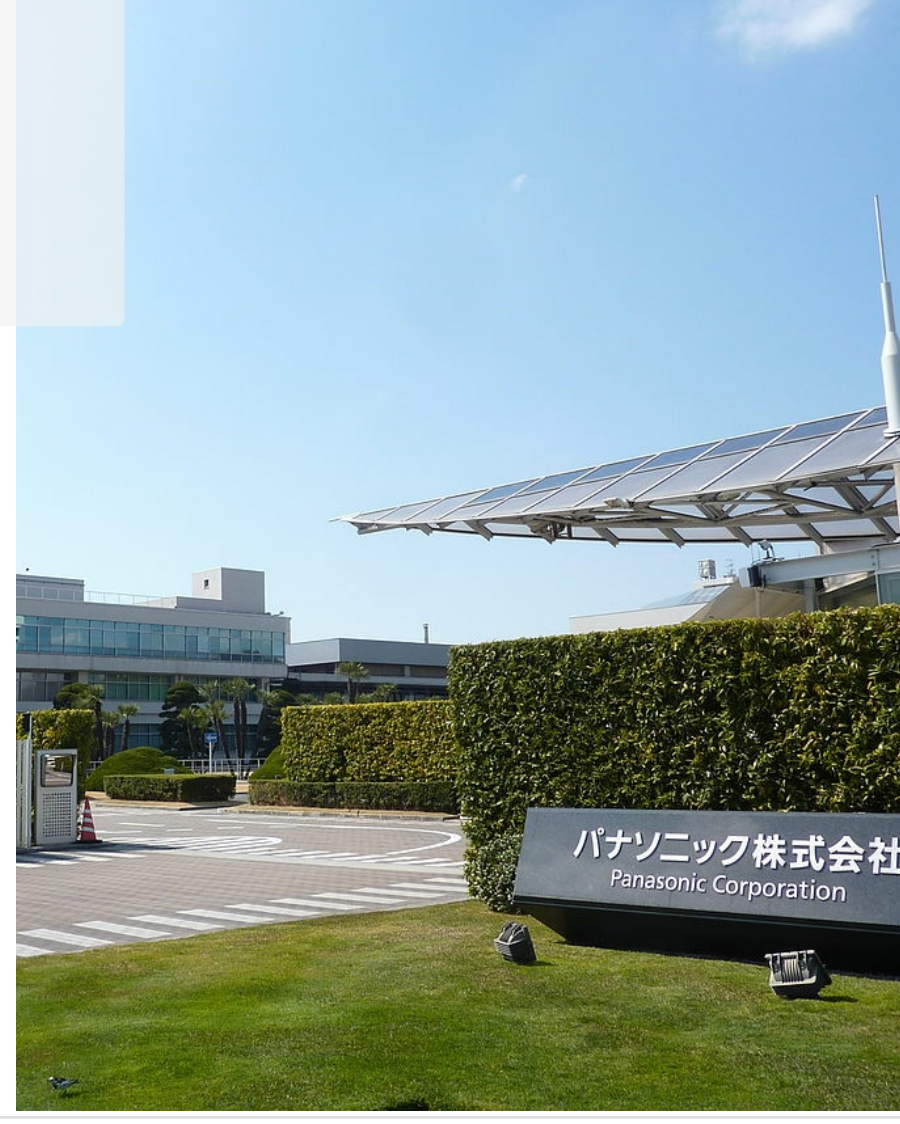
Page 1 | Panasonic Bespoke Inhouse Server